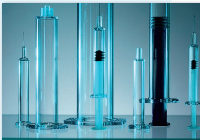
Prefillable syringes Schott TopPac™, manufactured by Schott Glas

For this reason, a number of TOPAS grades have been studied in a biocompatibility test program. The TOPAS grades studied meet the requirements of US Pharmacopoeia XXIII Class VI and ISO 10993. Certificates are available on request.