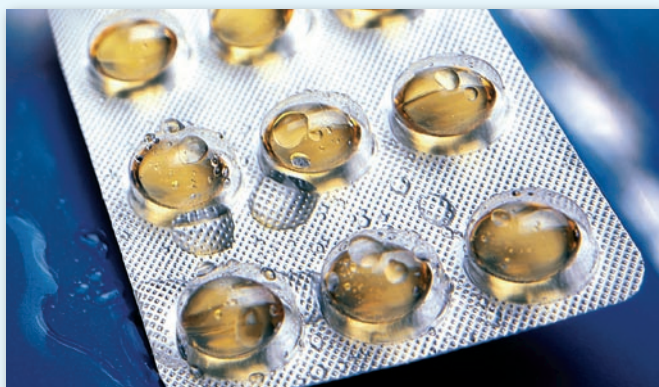
Blister packaging film made with TOPAS

With its remarkable property profile compared with known plastics, TOPAS COC offers new options for these applications.